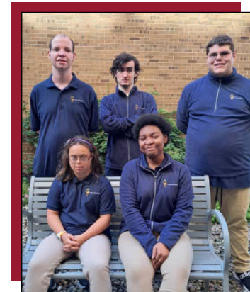
2022/2023 Project SEARCH interns at Corewell Health