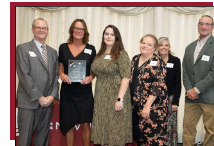
Stylerite receiving their Employer of the Year Award at our 58th Annual Awards Ceremony & Banquet